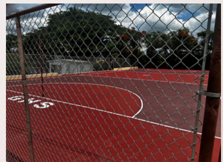
The newly refurbished netball court at the school made possible through the generous support of the alumni association.