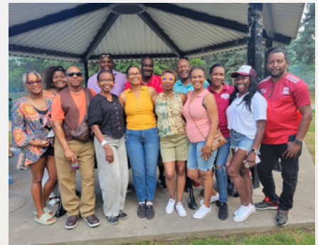
Members from the GHPSA Canada chapter are all smiles at their summer picnic event.